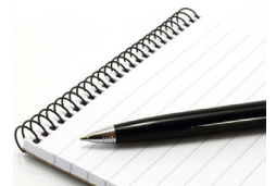
Pen and Paper

Students will be required to provide or have access to the above equipment and materials.