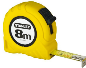
8m measuring tape