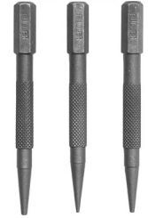
Nail punch set