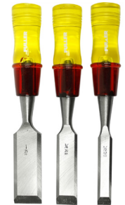
Chisel set (includes 25mm)