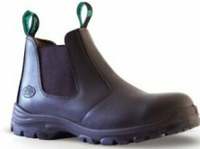
Steel cap boots